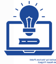
Specialization and expertise