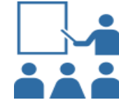
Specialized training and meet stakeholders