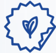
Good practices exchange for staff