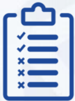
Strengthen the recognition system