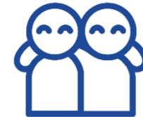
Cultural value and tolerance